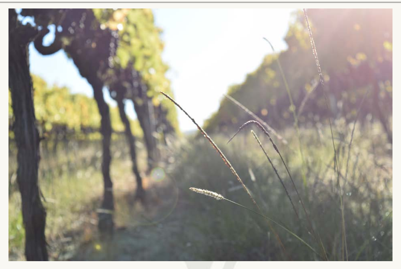
Vintage 2016 Summary